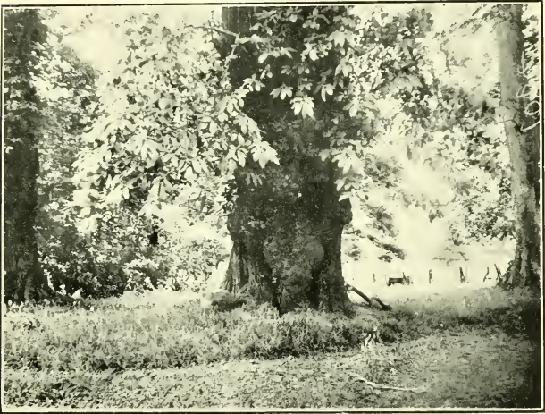
Tree in Cranmore, Malone, to which William III's horse was tied while he was resting on his way to the Boyne.

the second son of Silence, was the next representative of the House of Nassau. It was he who drove the Duke of Parma with his besieging army from the walls of Bergen-op-Zoom—that army which the Invincible Armada was to have landed on the shores of